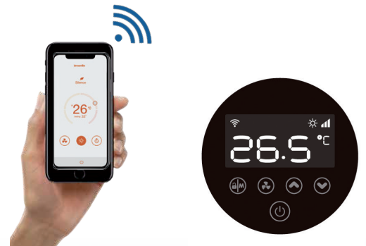
Wi-Fi Built-in Touch Controller