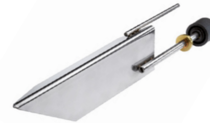
Replaceable stainless steel large area electrodes for different conductivities