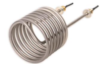
Resistor type heater elements in highly corrosion-resistant alloy