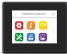
3.5" touch display

All HygroMatik FlexLine units are equipped with a capacitive 3.5" touch display. Operation and programming are selected via a flat and intuitive menu structure analogous to modern smartphone logic. In addition to this, subsequent software updates are quickly and easily possible via USB flash drive.